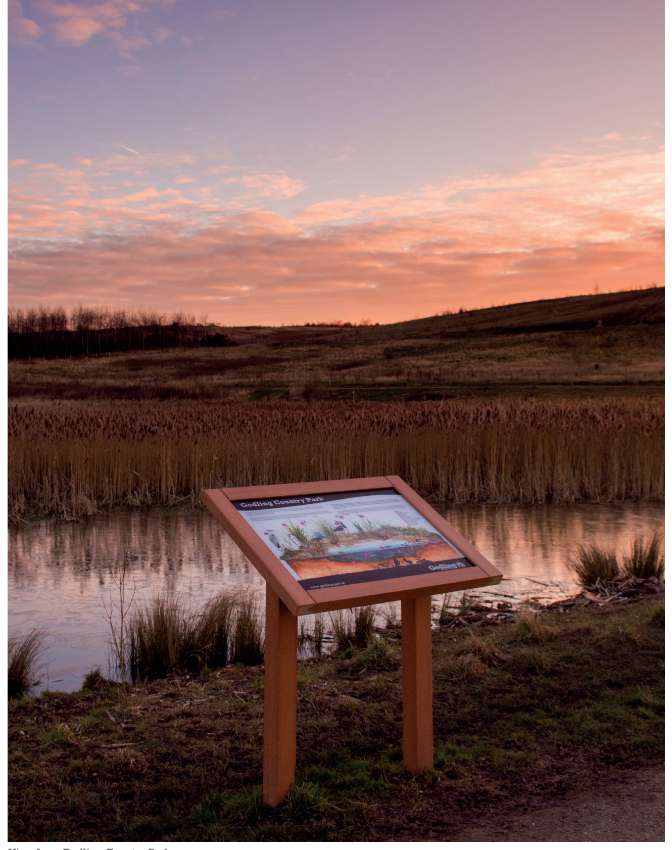
View from Gedling Country Park